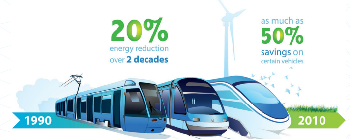
Industrial Focus on Energy Efficiency Innovation

Even with a past environmental performance record better than any other major mode, the rail sector is committed to further reducing its GHG emissions. In particular, the European rail industry , representing 46% of the global market for rail supplies, is actively focused on continual innovation of rail system technology in order to further improve energy efficiency and reduce GHG emissions while at the same time boosting the attractiveness of rail transport and thus eliciting a modal shift from more polluting transport modes to rail.